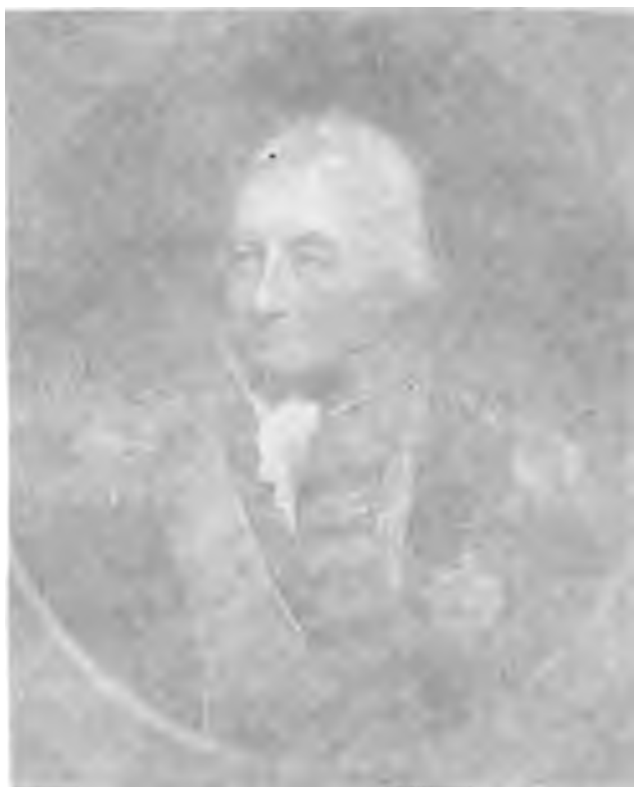
John Jervis, Earl St. Vincent.